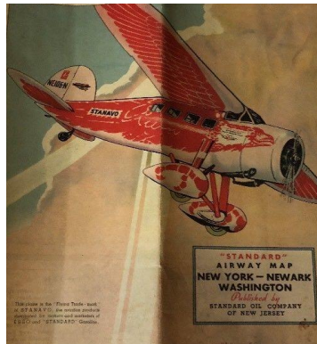
<1932 Standard (NJ) Airway map (GDC)

1930 Standard Oil (NJ) road map of MD/DE/DC/VA/WV has a list on the side cover of airports and landing fields. It lists private and military airports and those run by the Dept of Commerce along airways between major cities.