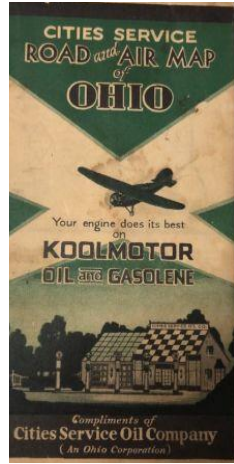
1930 OH Road & Air map